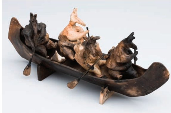
Philip Samuel Black

Irit Lepkin For Left (2 pieces) 7.5 x 22 x 6 cm Clay