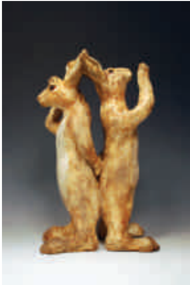
Florence Chik Lau

Florence Chik-Lau Two for the Road 17 x 22 x 38 cm Ceramic sculpture