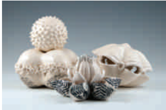
Celia Zveibil Brandao

Celia Zveibil Brandao Delicate Balance 20 x 27 x 13 cm Earthenware with glazes