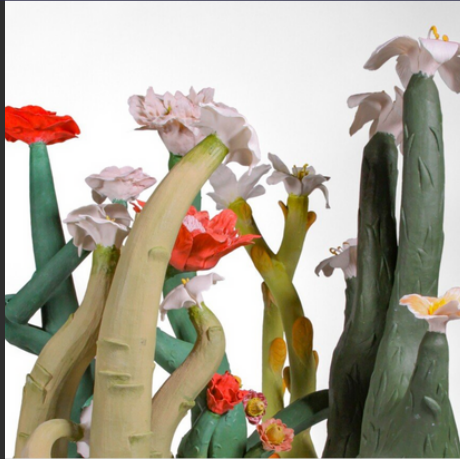
Tatiana Argueta Garcia

Taking inspiration from nature, my work focuses on floriography, the language of flowers, and aims to show how simple objects can hold meaning and significance.